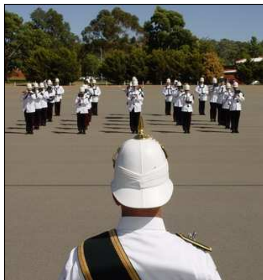
The Australian Army Band Kapooka on Parade.