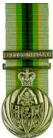
The Australian Service Medal

For meritorious service and performance of duty while employed as the Regimental Sergeant Major of the 2nd Battalion, Royal Australian Regiment, 11th Brigade and the Army Recruit Training Centre.