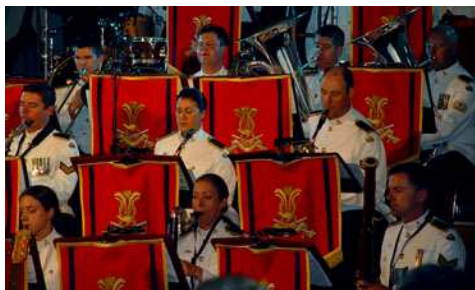
The Australian Army Band Kapooka in Concert

those requests you put on those yellow Friends of the Band subscription